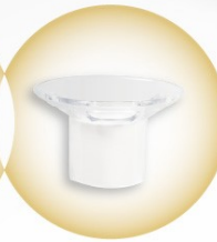
Circular Anal Dilator